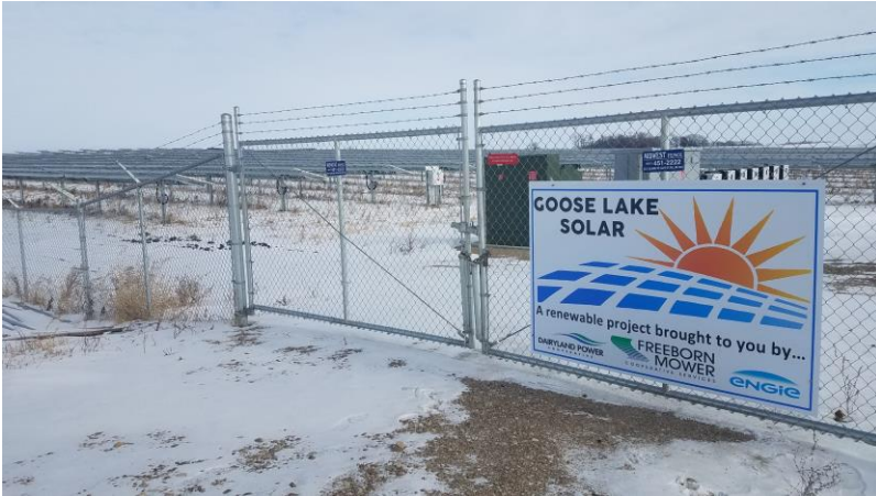
Dairyland Power 1.5 megawatt solar project, Albert Lea, MN